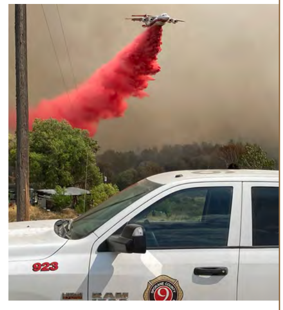
FIRE 9 PERSONNEL SUPPORTING AIR OPERATIONS.

Interagency agreements with the Washington State Fire Marshal's Office, Washington Department of Natural Resources, and the Bureau of Land Management have been in place for many years with Spokane County Fire District 9. The reason for these agreements is to provide a process to mobilize District firefighters and equipment to respond to emergencies outside the Fire District. In addition, the agreements allow the Fire District to